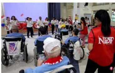
由ACE乐龄举办的首个国庆庆祝活动昨天在安老协会举行