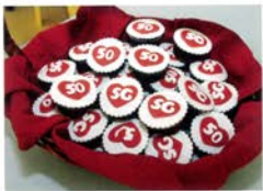
A 10-year-old French girl and her mother baked special red-and-white cupcakes for beneficiaries of Bright Vision Hospital, in celebration of Singapore's National Day.

ESTIMATING THAT THERE WERE 15,000 FRAIL ELDERLY WHO WERE UNABLE TO ATTEND THE NATIONAL DAY PARADE (NDP) CELEBRATIONS 'LIVE' AT THE STADIUM OR AT HOME WITH THEIR FAMILIES, ACE SENIORS, A MEMBERSHIP-BASED SOCIAL ENTERPRISE THAT PROVIDES TRAINING AND CONSULTANCY SERVICES AS WELL AS COMMUNITY PROJECTS FOR OLDER PEOPLE, DECIDED TO HOST NDP TELECAST SESSIONS AT THREE NURSING HOMES AND TWO COMMUNITY HOSPITALS WITH FRAIL ELDERLY RESIDENTS.