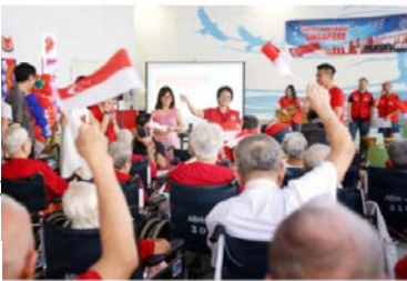
The seniors from All Saints Home in Jurong East sang National Day songs, belted out classic Malay and Chinese tunes, and ate traditional snacks during the mini carnival brought to their door step.